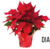
8 INCH DIAMETER POT