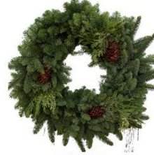
18 INCH DIAMETER MIXED GREENS WREATH