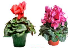
4 INCH RED OR PINK CYCLAMEN