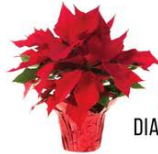
8 INCH DIAMETER POT