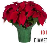
10 INCH DIAMETER POT