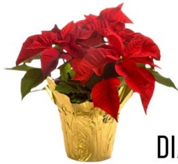
6 INCH DIAMETER POT