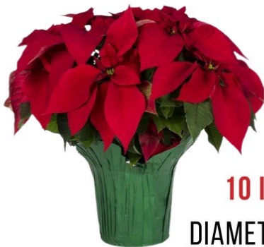
10 INCH DIAMETER POT