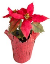
4 INCH DIAMETER POT