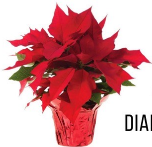
8 INCH DIAMETER POT