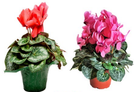
4 INCH RED OR PINK CYCLAMEN