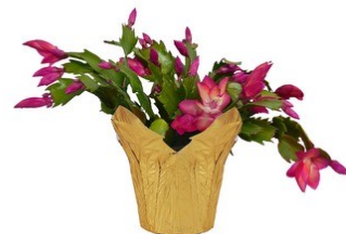
4 INCH DIAMETER POT CHRISTMAS CACTUS