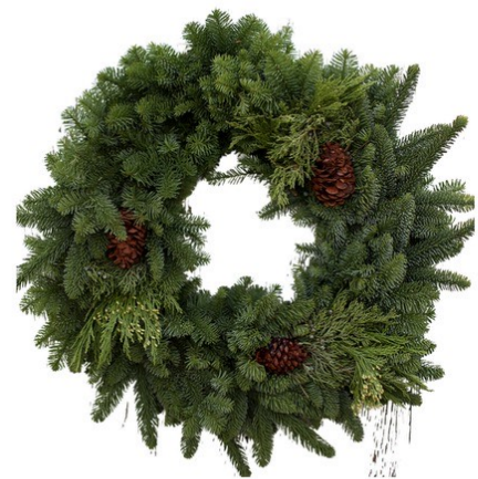
14 INCH DIAMETER MIXED GREENS WREATH