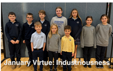
January Virtue: Industriousness