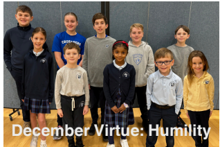
December Virtue: Humility